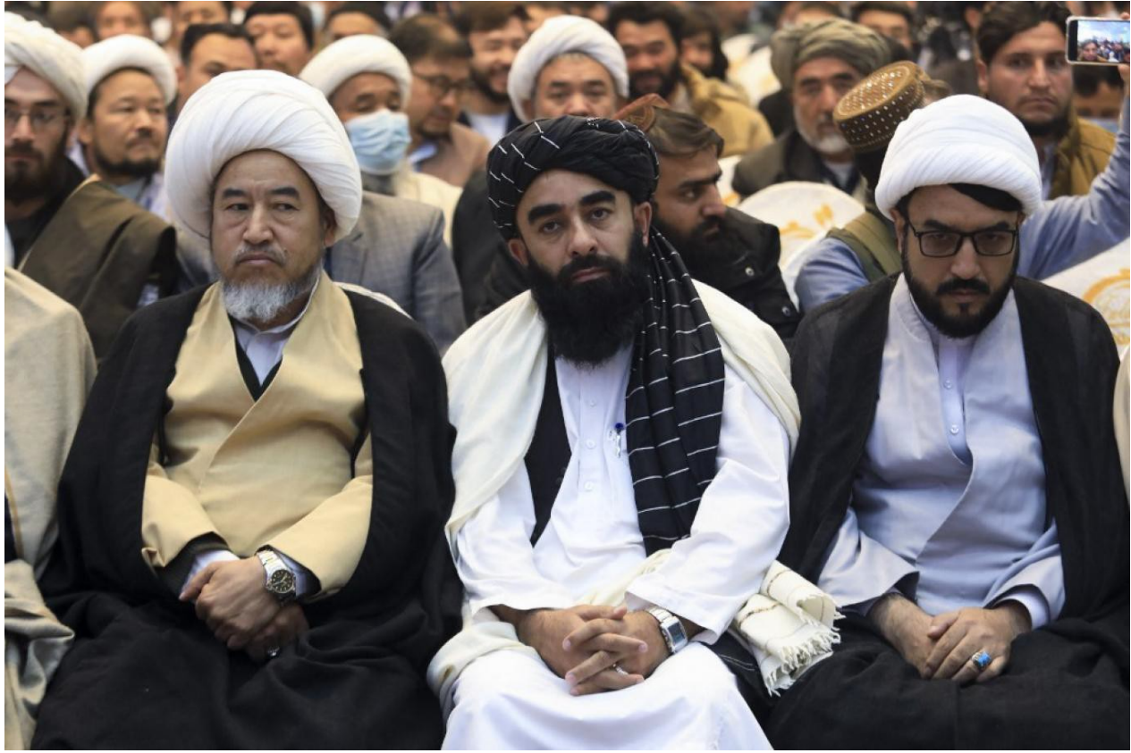
Zabiullah Mujahid, the spokesperson of the Taliban, joined in a religious summit of Shia leaders to give the false impression that the Taliban respect Shias.

Much of the West would like to believe that after tiring of their war against the Taliban and their abandonment of Afghanistan, somehow the Afghan people will eventually overthrow Taliban tyranny. Meanwhile how many lives will be lost? How many lives will be destroyed?