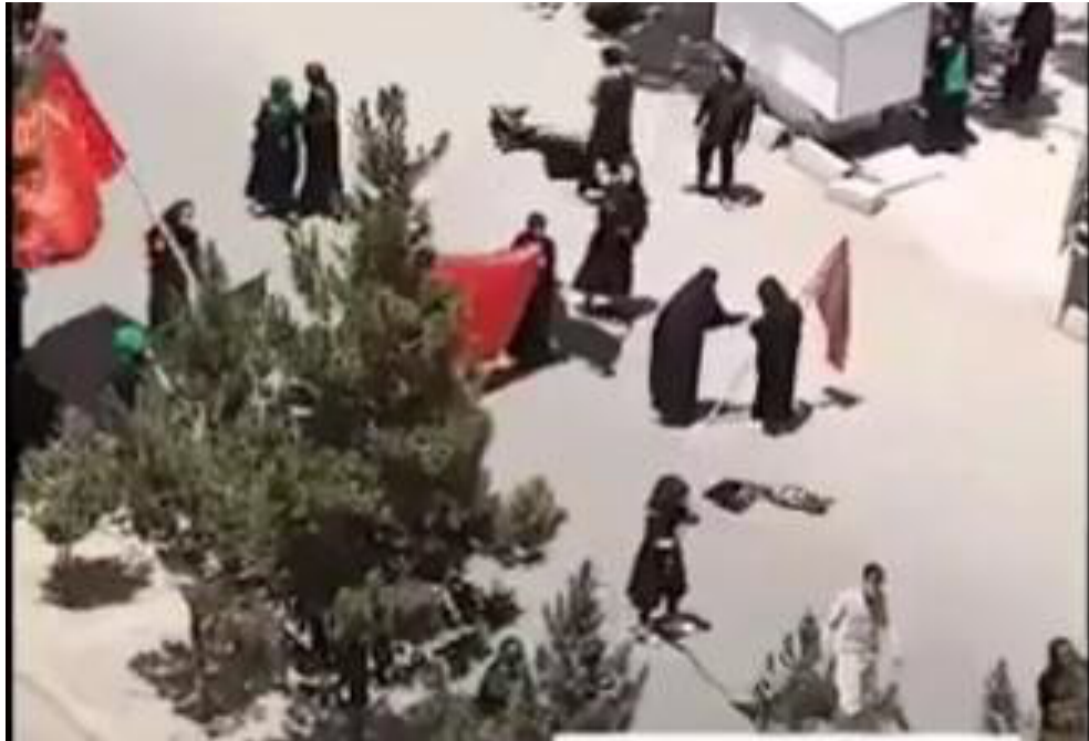
The Taliban attacked a Hazara crowd gathered for the religious ritual of Ashura.