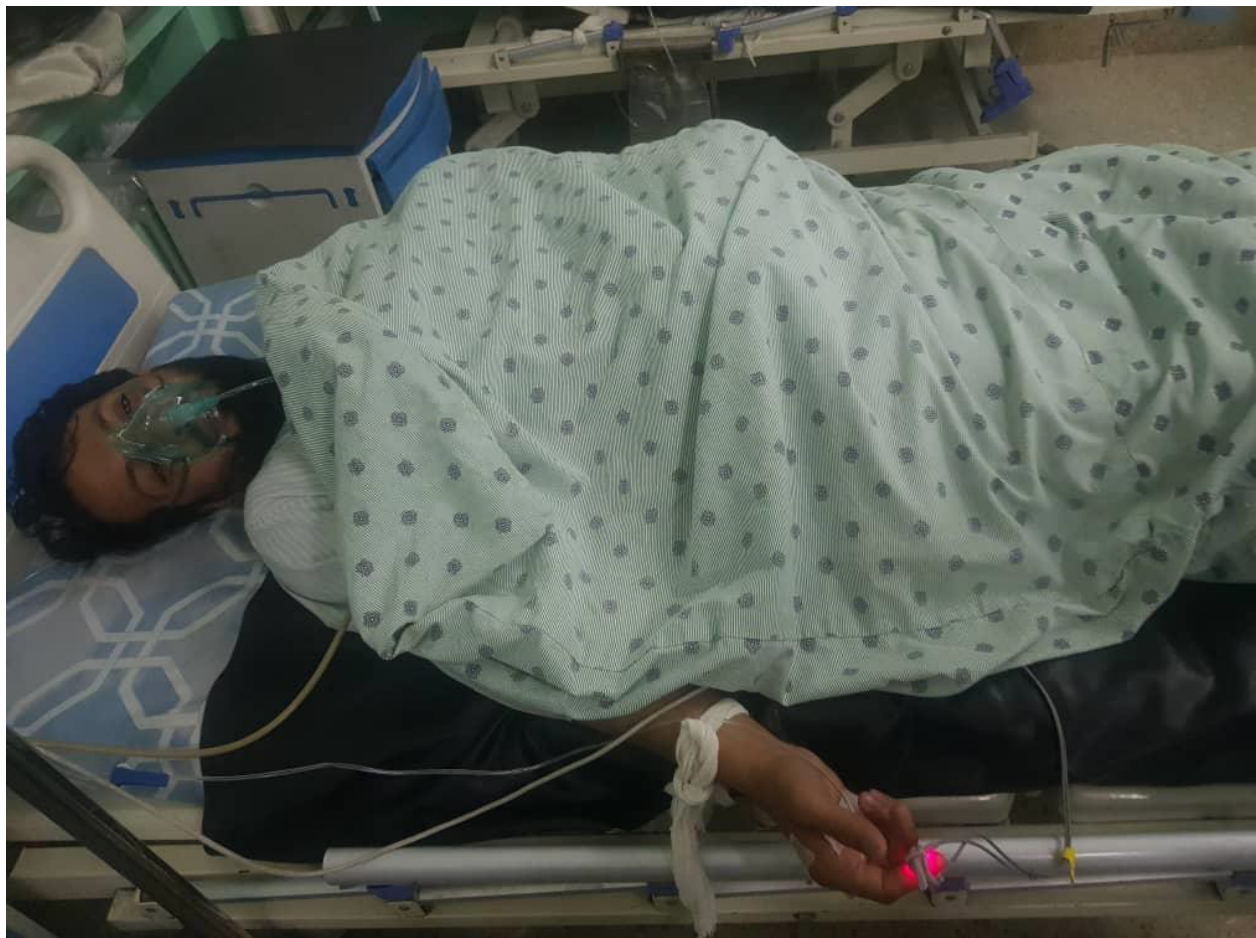
An Afghan journalist who was arrested and tortured by the Taliban.

"Their detective threatened to kill my wife and children. They tied my hands and feet and carved a line on my body with a knife. Some days, they heated a metal baton and held it on my back to burn me. I can't believe that I am still alive after the vicious torture in the Taliban prison."