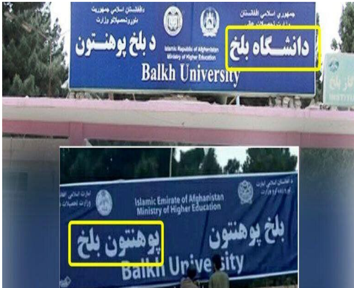
Taliban removed "Persian" words from banners at universities in Balkh Province.