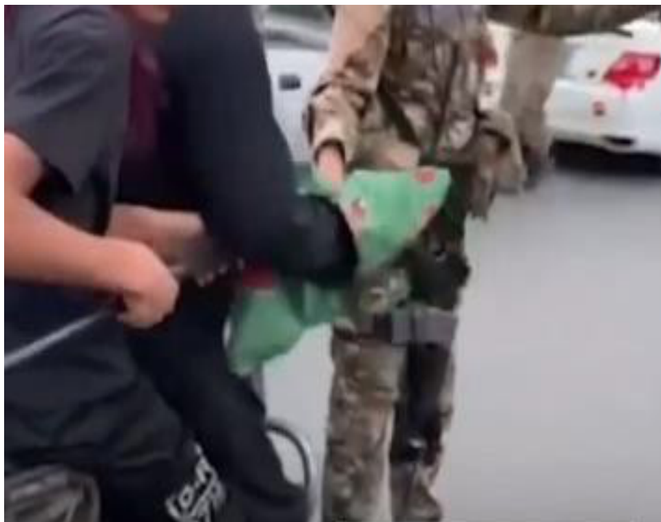
Taliban soldiers remove a banner from a religious ceremony of Shias during Ashura.

During the 2023 Ashura ceremony, the Taliban invaded Shia mosques to search for Shia religious leaders. One woman who participated in these gatherings said that Taliban soldiers even entered the women’s areas of the mosques and physically attacked Hazara women. She said she was very frightened. All the Hazara Shia women tried to escape, but the Taliban continued beating women and insulting Shias. One of the soldiers shouted at the crowd that, “We will kill all of you and we will kick you out of the country.”