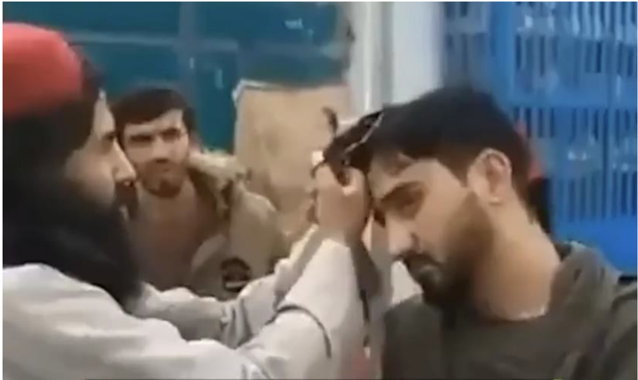
Taliban Ministry for the Propagation of Virtue and the Prevention of Vice cut hair of man on street as punishment.