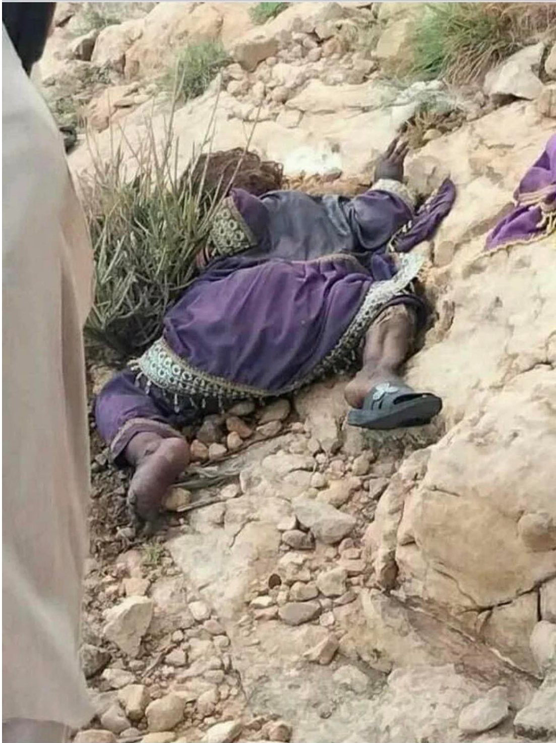
The Taliban executed over 150 Hazara Shias in Balkhab District, Bamyan Province in 2022. The Taliban would not allow proper Islamic burial of their bodies.