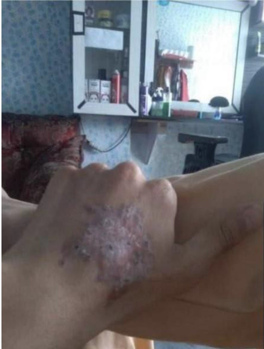
Taliban threw acid on the hand of a boy who had a tattoo on it.