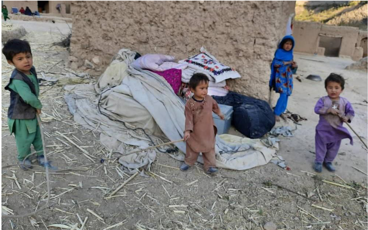
Taliban forced Hazaras to leave their properties in Daikundi province.