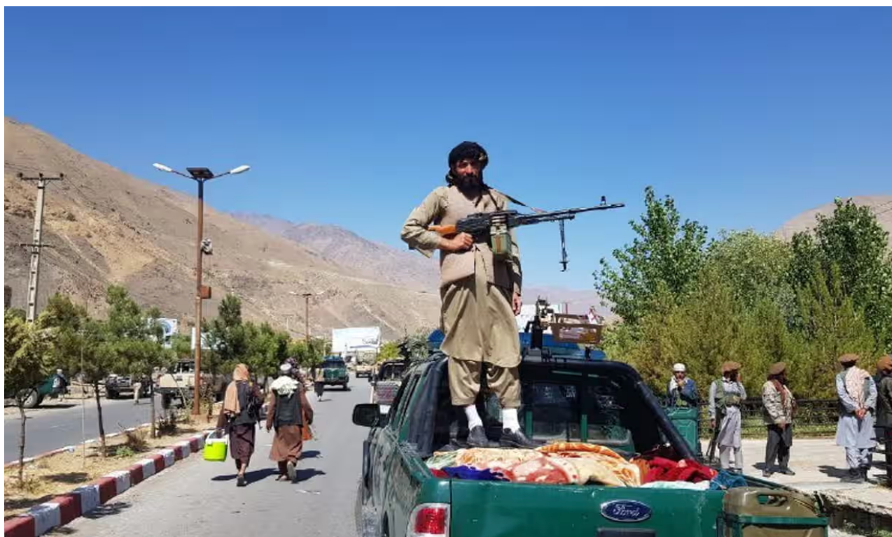
Taliban gunmen in Panjshir murdered 20 civilian protesters.

The Taliban believe that their government is representative of God’s authority in Afghanistan. Consequently, any opposition to their government equals hostility against God. The Taliban arrest and execute those who fight in resistance movements against their forces. When protesters in Panjshir province announced their disagreement with Taliban policies, the Taliban killed the protesters.