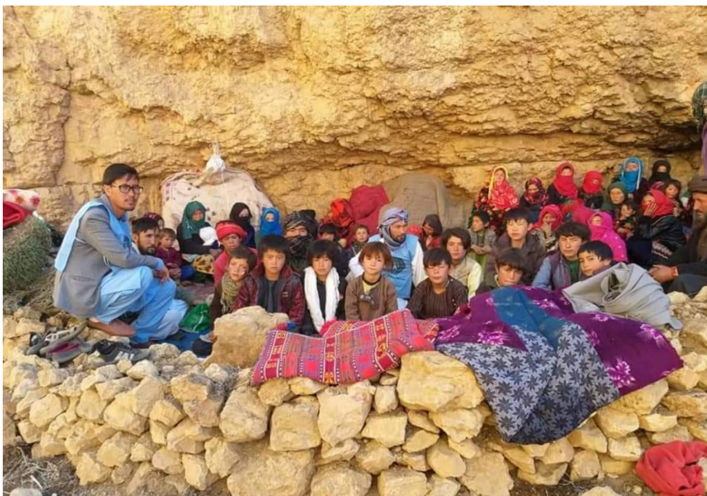
Taliban forbade Islamic burial of bodies of 150 Hazaras killed in Balkhab, Bamiyan 2022

The soldiers said to the father of the girl that if he disagreed, the soldiers would rape his daughter and his wife. The soldiers told him that he had to force his daughter to get married immediately. They started beating me and they broke one of my legs. Our daughter is a victim of the Taliban’s crimes. I have no news about where she is now. What is she doing? Maybe she has committed suicide.”